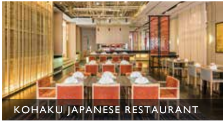
KOHAKU JAPANESE RESTAURANT

A taste of Japan with a choice of delicate sushi, delicious sake and more. Dine in relaxed ambience with private rooms available.