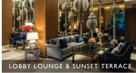
LOBBY LOUNGE & SUNSET TERRACE

Enjoy cocktails, music and good times in the relaxed ambience. The perfect place to enjoy the night.