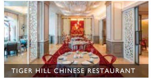
TIGER HILL CHINESE RESTAURANT

Continental, Asian and Thai cuisine in warm and cozy surroundings, voted one of the best restaurants in Yangon.