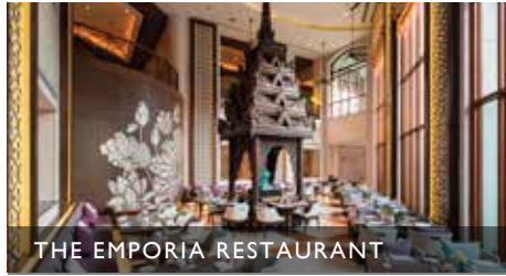
THE EMPORIA RESTAURANT

A taste of Japan with a choice of delicate sushi, delicious sake and more. Dine in relaxed ambience with private rooms available.